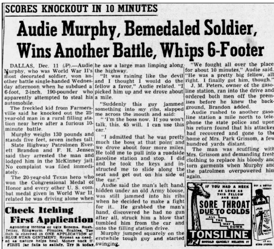
Figure 2: A published account of Audie's ten-minute fight with a would-be car hijacker.

While on an extended Thanksgiving-Christmas visit with family in 1946, Audie was returning to Farmersville from Dallas on a cold, rainy afternoon of Wednesday, December 11, 1946. He