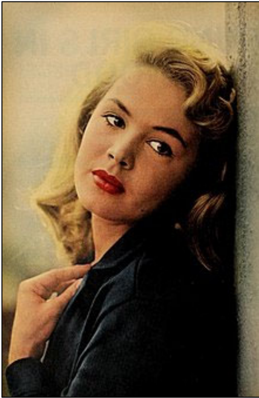
Sandra Dee in 1959. Born in 1942, Ms. Dee would sadly pass away in 2005 after a lifelong battle with anorexia nervosa and kidney disease.